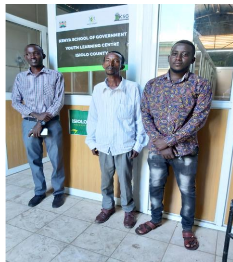
Figure 2: Beneficiaries of Isiolo Youth Innovation Center